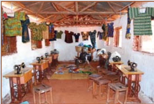
The Linda Centre Vocational School